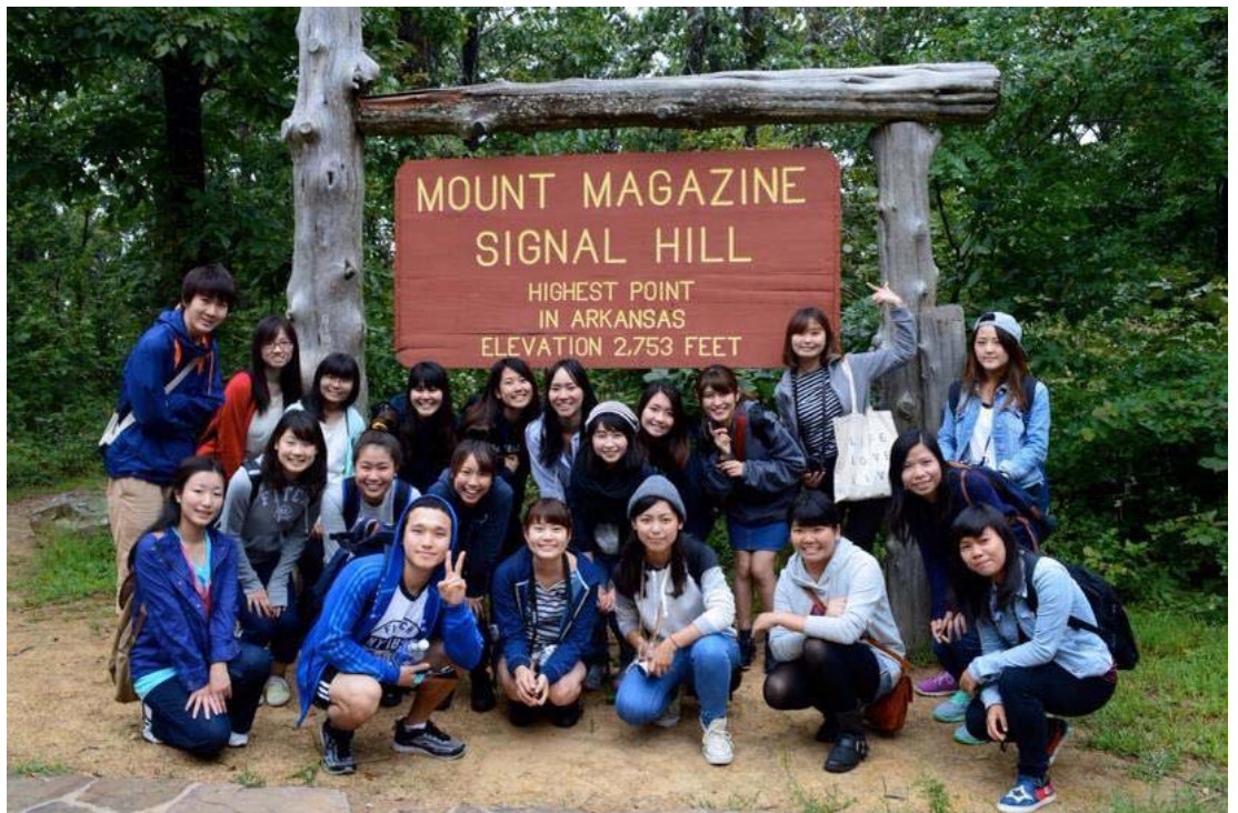
This is a group photo of all the international students that attended the Mount Magazine trip in 2014 Fall semester.